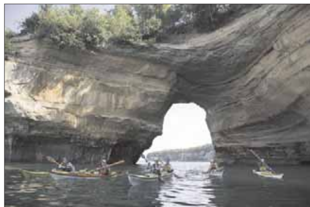
The kayakers pictured here exploring Lake Superior. Visit nicoletcollege.edu for the full list of classes.

The scenic lakes, rivers and forests of the Upper Midwest will be the classroom for dozens of Nicolet College Outdoor Adventure Series classes April through September.