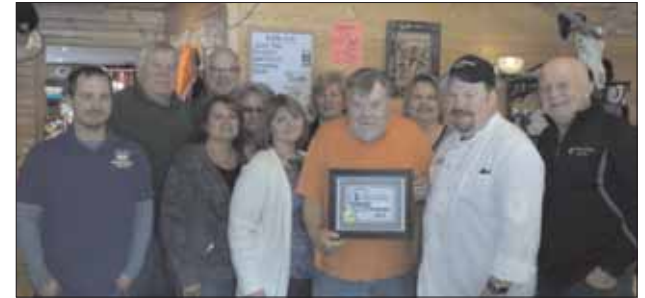
Board members of the Forest County Chamber of Commerce were very pleased to officially welcome Main Street Ed's in Argonne as the newest member. The Chamber is holding this quarter's monthly meetings at the restaurant. The next two meetings are set for May 5 and June 2, each beginning at 11:30 a.m., so plan to attend!