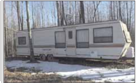
29+ Acres on Sipple Road, Crandon

Lake living that is a step back in time but with modern conveniences! A full log home built in the early 1900's and updated in the 2010's. Featuring a newly remodeled bathroom, central air, furnace, doors, 2nd bedroom, & 8x10 shed all added in the past 4 years. A full basement was added with stubbed in plumbing for a bath and laundry. The basement could easily be converted into additional sleeping area or rec room. The 4-car plus garage with cement floor & clear ridge vent save on electricity w/natural day lighting. You may also save on utilities by using the wood burning stove to heat the home. Pickerel Lake is a 1,300 acre full rec. lake with great fishing. ATV and snowmobile trails are at your doorstep! Call soon. Priced at only $185,000