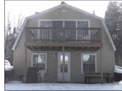
W5803 West Point Road, on Pickerel Lake

Wooded acreage located on Sipple Road in Nashville, adjacent to over 200 acres of Forest County land! The owner states that the land is good hunting for deer and bear. The apple trees on the property are a great food source for wildlife. There are fire trail roads cut through the property for easy access throughout the property. Located on snowmobile & ATV trails & close to hiking, biking, & horseback riding trails. The property is in closed MFL providing a tax advantage while keeping the property private. Within 3 miles of Crandon, close to Hwy 8 for easy access to Rhinelander, & close to Mole Lake, shopping & nightlife are close by. A trailer on property is included in the asking price w/ propane heat. Priced at only $55,000!