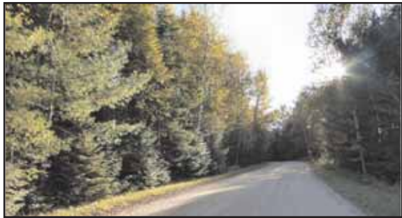
2 lots in Pickerel on the Pickerel Creek.

Creek comes out of Pickerel Lake over the dam. You can canoe down to the Wolf River most of the time, there may be a couple of portages. Near thousands of acres of Langlade County land, and on the snowmobile and ATV trails. Great area to build your home or get away cottage. Land is between Rolling Stone Lake and Pickerel Lake. There are a lot of recreational opportunities and plenty of sheer pleasure moments to enjoy. 5+ acres on Potrykus Drive on the Pickerel Creek. Priced at $18,000