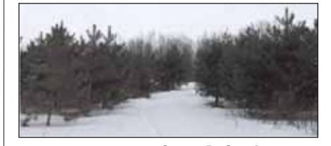
104+ acres on County B, Crandon

Across the road from 1,670 ac. Pine Lake on 3.35 acres of land which borders 1,000's of acres of Nicolet National Forest is a move in ready home with 2 single car garages, a fish cleaning building, extra storage sheds, and an above ground 14' swimming pool. Inside are 2 bedrooms, 1 bath, plus an enclosed porch w/ hot tub and seasonal sleeping space. Use the natural gas furnace to keep warm or the economically friendly wood burning stove. Furnishings are negotiable. The home is located close to Pine Lake beach & boat landing & bordering Nicolet National Forest. A home to get away from it all, do it all, or do nothing! The choice is yours! Priced below Fair Market Value at only $68,900!