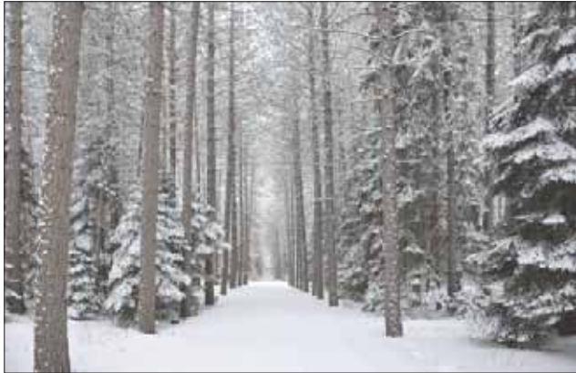
Archibald Parkway in the town of Townsend by Roger Spaude. Taken on a fine spring day-April 13, 2016. Good shot!