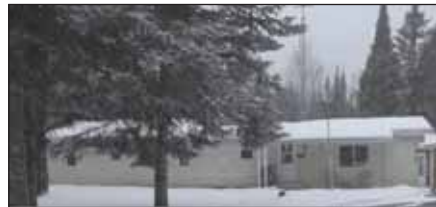
8275 West Pine Lake Road, Hiles

Bear Lake is a pristine 66 acre, 20' deep lake, with clear water and sandy beach. Only electric motor boats on this no wake lake keeps the water clear and the fish plentiful! The newly completed Rat River Recreational hiking and biking trail is a short distance away from the parcel. This parcel is located on both sides of Bear Lake Road with 134' of lakefront. According to the seller, you may build on the lake side of the property. Your views of the lake will remain the same with the National Park located across the lake. Come & camp until you decide to build your dream home. With the western exposure you will be able to relax and enjoy the sunset from the shore. This 1.65 acre parcel is priced $45,000 below Fair Market Value. Priced at $70,000