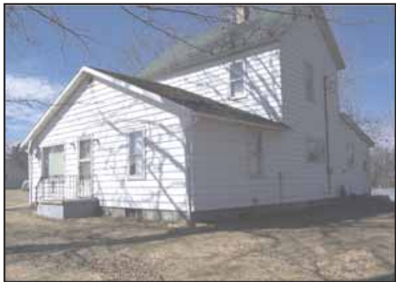
107 W. Pioneer St. Crandon

Creek comes out of Pickerel Lake over the dam. You can canoe down to the Wolf River most of the time, there may be a couple of portages. Near thousands of acres of Langlade County land, and on the snowmobile and ATV trails. Great area to build your home or get away cottage. Land is between Rolling Stone Lake and Pickerel Lake. There are a lot of recreational opportunities and plenty of sheer pleasure moments to enjoy. 5+ acres on Potrykus Drive on the Pickerel Creek. Priced at $18,000