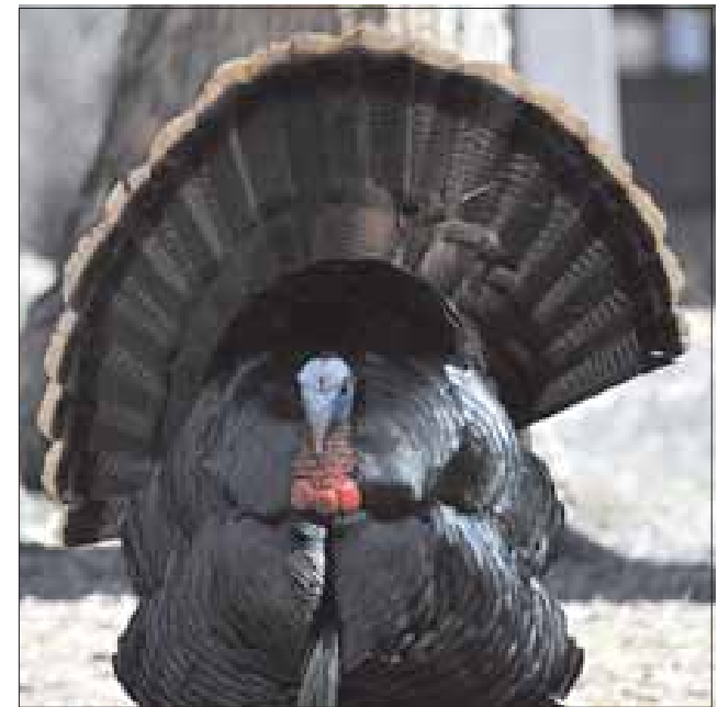
Okay turkey hunters-This is what they look like!