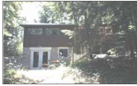
355 Frazer Lane, on Pickerel Lake

Lake living that is a step back in time but with modern conveniences! A full log home built in the early 1900's and updated in the 2010's. Featuring a newly remodeled bathroom, central air, furnace, doors, 2nd bedroom, & 8x10 shed all added in the past 4 years. A full basement was added with stubbed in plumbing for a bath and laundry. The basement could easily be converted into additional sleeping area or rec room. The 4-car plus garage with cement floor & clear ridge vent save on electricity w/natural day lighting. You may also save on utilities by using the wood burning stove to heat the home. Pickerel Lake is a 1,300 acre full rec. lake with great fishing. ATV and snowmobile trails are at your doorstep! Call soon. Priced at only $185,000