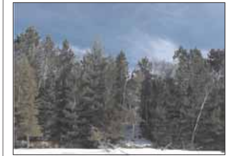
1.6 acres on Bear Lake Rd on Bear Lake

Energy efficient year round home located on beautiful 1,300 ac Pickerel Lake! There's a wood burning furnace, forced air furnace, & wood burning stove for heating. This walk out ranch is partially underground to help regulate the temperature in all seasons. New roof & siding in 2011. The interior of this 2 bed, 2 bath home has a quaint cabin feel. Lake living w/ATV & snowmobile trails across the road for all types of activities. Located on a dead end road gives a feeling of privacy. An open concept kitchen, dining, & living room allow for easy visiting. A deck on the second floor is great for viewing wildlife. The home has an attached 2 car garage & large shed for storage. Whether looking for a seasonal cabin or year round home, this is a must see property for only $159,900