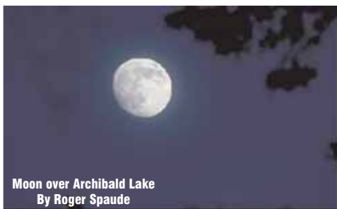
Moon over Archibald Lake By Roger Spaude