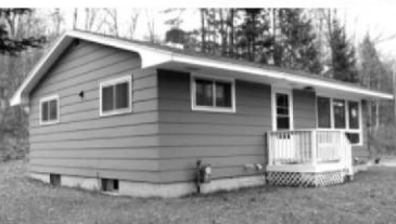
8943 E. Pioneer Street, Crandon

throughout and butts up to the Nicolet National Forest for years of privacy and a steady supply of game. The cozy comfortable newer cabin offers multiple heat sources of solar, electric and a wood burning free standing stove. Enjoy the hickory cabinets, open concept dining and living space and bathroom with a shower. The additional out-door privy is also a welcome feature and there's a wood-shed for additional storage. For the hunters there is a large metal and a wood enclosed tower hunting-shack with door and windows just 100 yards from the heated cabin. Two additional metal deer stands and multiple cleared food plots plus cleared trails through the forests offer terrific lines of sight. Open UTV, ATV and sled trails access, make your move for only $65,000.