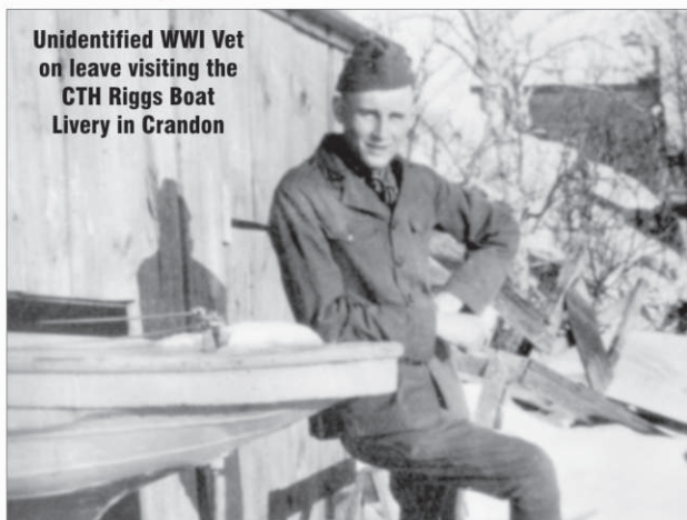
Unidentified WWI Vet on leave visiting the CTH Riggs Boat Livery in Crandon