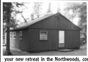
3795 Hwy 8, Cavour

Terrific location right on Hwy 8 and just a 1/4 mile from shopping etc. The large wooded 2 acre lot has a move-in ready home with 2 bedrooms and spacious country kitchen which opens up to the living area. The large detached garage has room for vehicles and many extras. Great affordable home for first time buyers. Call today for your appointment today. Listed at only $59,950.