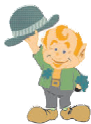
Happy St. Patrick's Day

We can supply you with all you need to raise your chicks: Feeders, Water Dishes, Incubators & More!