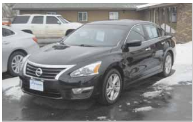
2013 Nissan Altima SV 64,000 miles $7,900