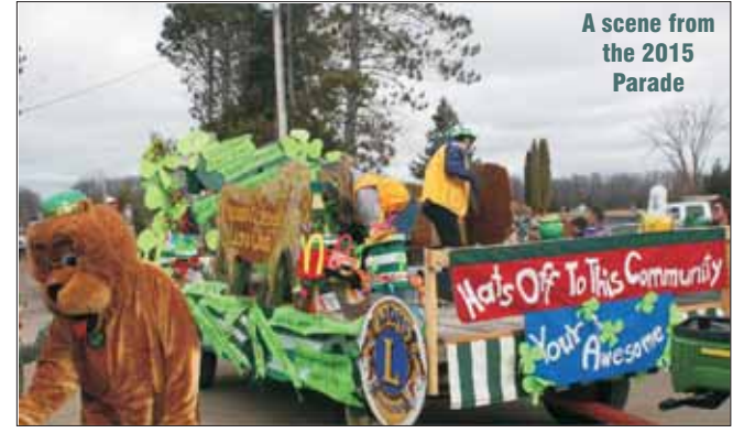
A scene from the 2015 Parade

Dig out your green clothes! The annual St. Patrick's Day Parade is in Pickerel this Saturday, March 14. The parade begins at noon.