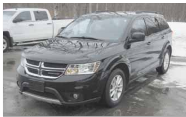
2015 Dodge Journey SXT All Wheel Drive, 3rd Row Seating $10,900

www.parsonsofcrandon.com Trade Ins Welcome Financing Available